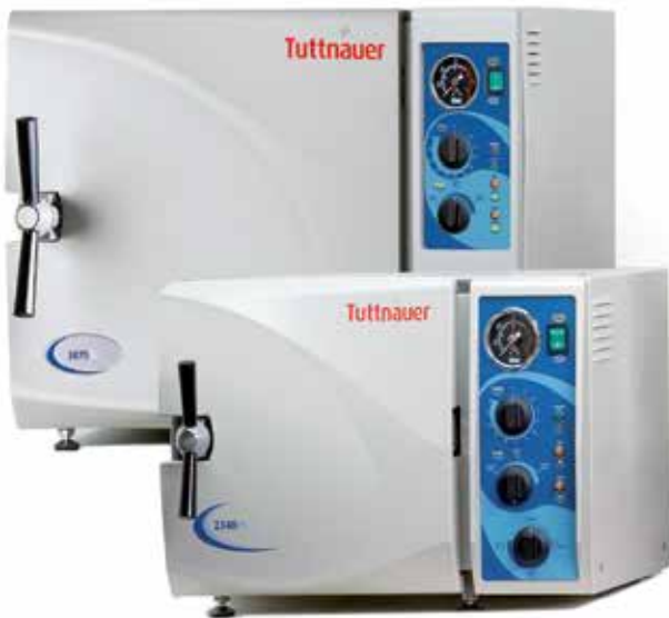
19/23 Liter Chamber Models