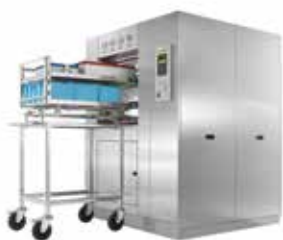
Large sterilizers for various industries and market needs

Featuring Tuttnauer's range of cleaning, disinfection and sterilization solutions