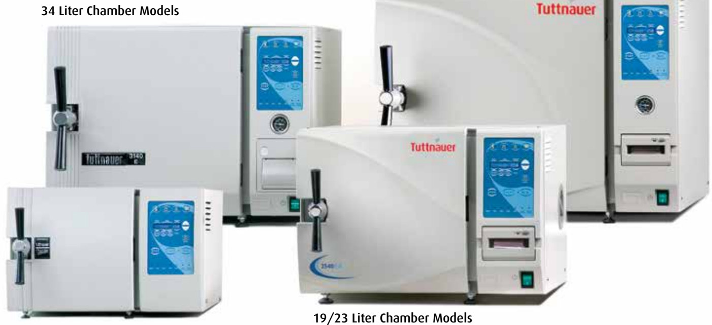
34 Liter Chamber Models