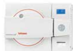
Pre & post vacuum tabletop sterilizers designed to perform class B cycles