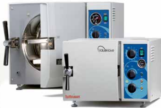
7.5 Liter Chamber Models

Complies with strict international directives and standards: