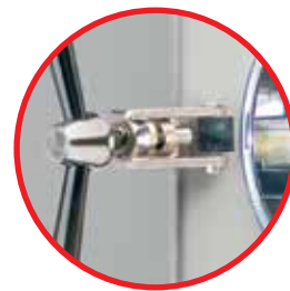
Double locking safety device

Complies with strict international directives and standards: