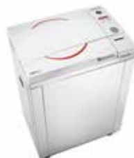
Laboratory autoclaves ranging in size and application