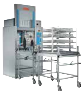
Washers/disinfectors for hospitals and laboratories